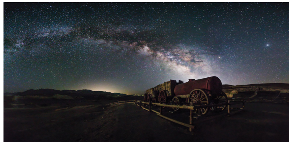
Harmony Borax Works, Furnace Creek, CA

The White Pine Main Street Association received a second Travel Nevada rural marketing grant for $10,000 (July 2021-June 2022) to design the Park to Park in the Dark website and brochure.